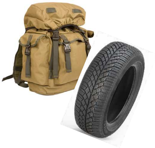
Backpack from old tyres – a sustainable idea?

= skin contact with approx. 500 toxic substances